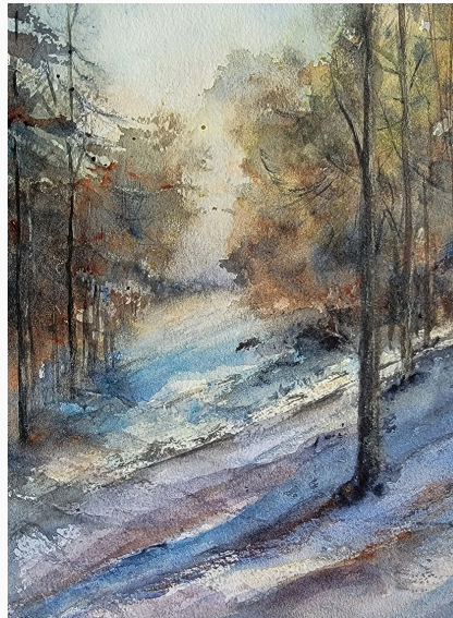
Diane Preus Watercolor