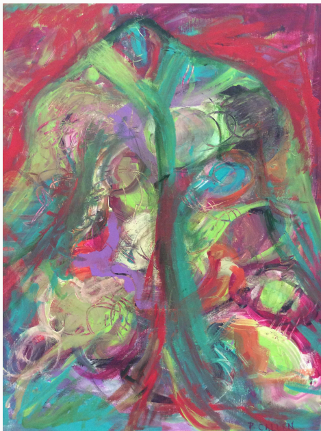
Psm Callen Oil